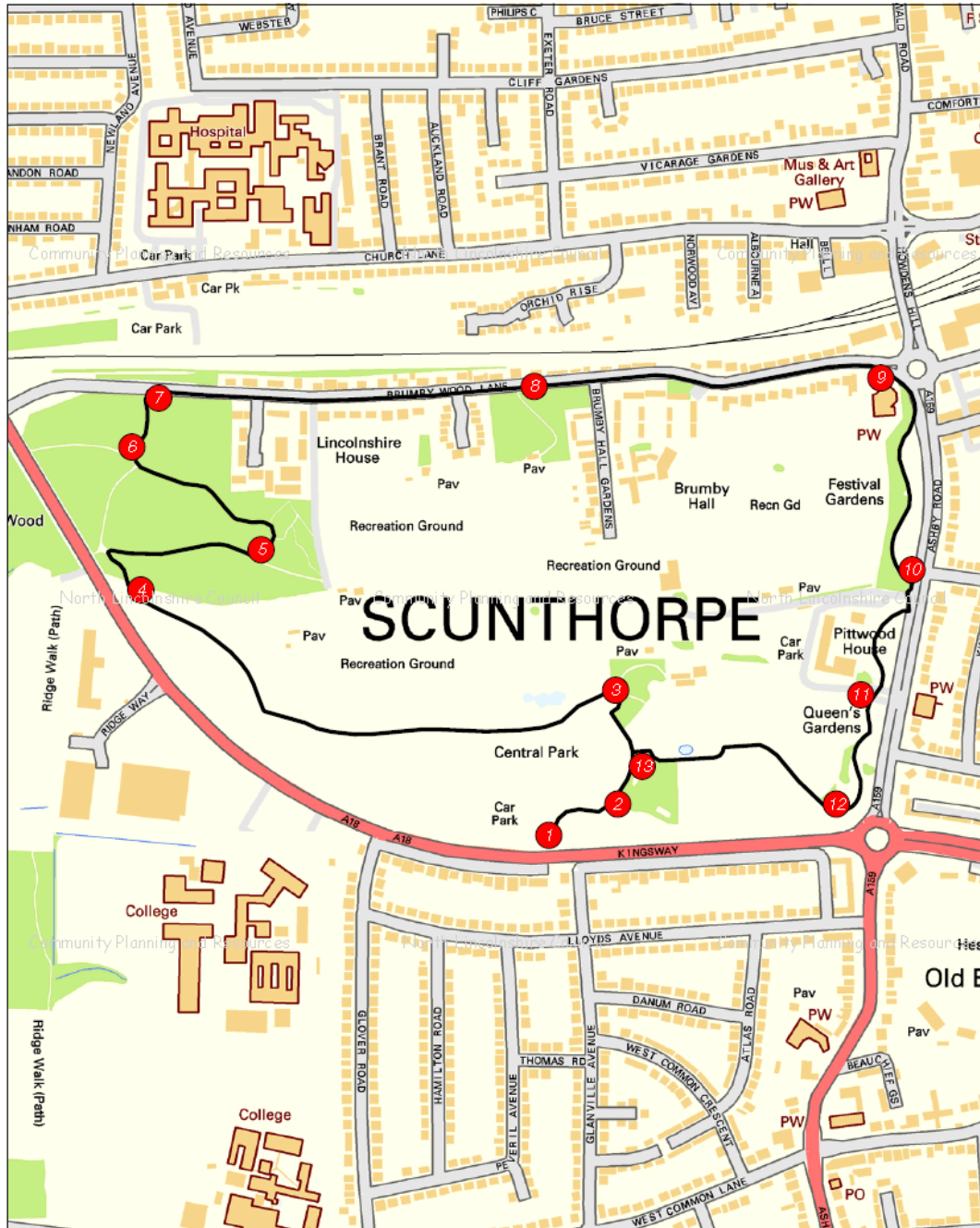
Drawing Title: Central Park Walking Route

Scale: Not to Scale Date: 1st April 2011